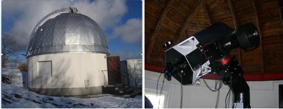
Figure 1: The telescope-dome and the 60 cm telescope at the Astronomical Station Vidojevica