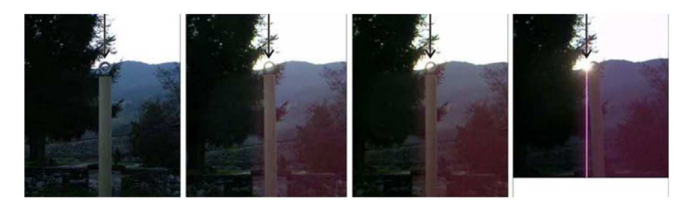
Figure 4: The Studenica monastery, St. John church, 6^{th} of May, 2011 (St. John's Day), 6 h 38 min (GMT+2): the sun came out exactly on top of the extended longitudinal axis of the church.

Parakklesis axis at St. Nicholas is directed approximately towards the summer solstice sunrise (fig. 3), so the parakklesis foundation was most probably laid down at the beginning of the longest day in the year. So that this parakklesis is also a sort of calendar: the appearance of the rising sun's rays on the church apse window marked the beginning of summer in its astronomical sense (Tadić and Gavrić, 2011).