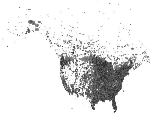
Figure 1: The map of 45570 North American FM transmitters (2005).

The maximal intensity of the reflected signal is obtained in the case of a coherent scattering: the transmitter, the trail and the receiver are aligned in such a way that the transmitter and the receiver are foci of an ellipsoid, while the meteor trail is tangent to this ellipsoid. In most cases the trail can be approximated as a straight line, but for meteors with a long duration ( \sim 10 s) the trail becomes deformed due to wind. Ionization useful for meteor forward-scattering occurs between 80 and 120km above the earth's surface, hence the maximum distance where reflected signal can be received is 2400km. In the case of the radar observations, the ellipsoid becomes a sphere which makes data analysis much simpler than in the case of forward-scattering.