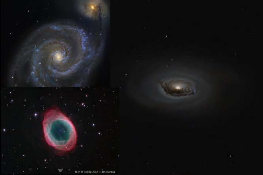
Figure 2: The first light images taken with the 1.4m telescope.