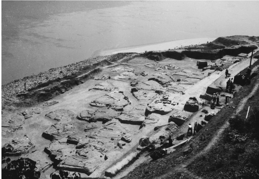
Figure 1a: Lepenski Vir 1968.