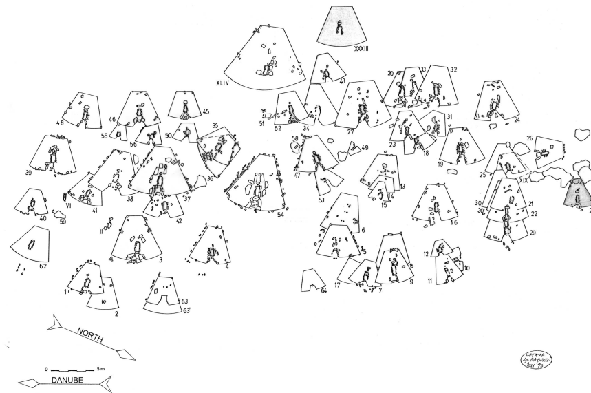
Figure 1b: The situation plan of the sanctuaries at Lepenski Vir.