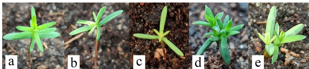
Figure 2: Seedlings of Thuja koraiensis Nakai (8 weeks old) in control (a) and in variants of plasma seed treatment with some morphological changes: milky white patches on the needles (b), more yellow color of the needles (c), two central shoots (d), two central shoots and milky-white patches on the needles (e).

During further observations of seedlings grown in containers in a greenhouse, samples with variegated color of needles, as well as with abnormal branching, were observed (Figure 2). It is noteworthy that the first type of anomalies in the control was encountered sporadically, the second was not detected.