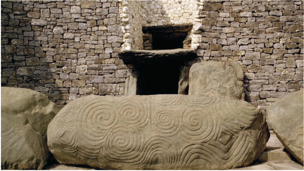
Figure 2: Entrance to Newgrange. Above you can see opening for the entrance of solar rays ( https://edition.cnn.com/travel/article/newgrange-ireland-stone-age/index.html )

enski Vir settlement only on the summer solstice. Namely, the Sun first appears in a relatively narrow gap, which lies between the northern slope of the Treskavac and a small solitary pointed rock on it (see Fig. 1). Then it follows Treskavac and rises again on its flattened top. Given the width of this very narrow gap on the horizon, Bajić and Pavlović found (Bajić and Pavlović, 2015, 2018, 2019), taking into account changes in the inclination of the Earth's axis and precession, that this unusual phenomenon can be seen from a specific place in the former position (which is today under the water), uniquely on the summer solstice which makes it possible to determine that day of the year, which is the basis for the solar calendar.